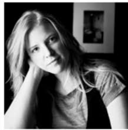
Sue Kessler Photographer Christian Oth Studio