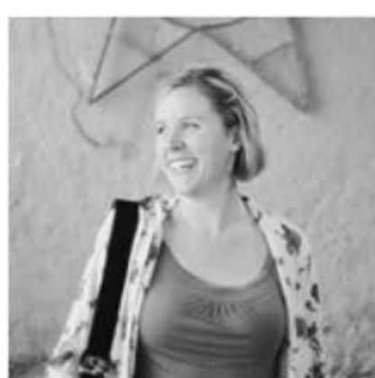
Catherine Mead Photographer