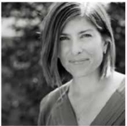
Erin Kate Photographer